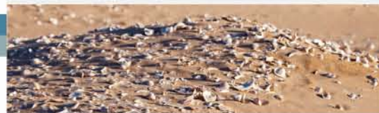
Midden material evidence of the use of the Tarkine area by Tasmanian Aboriginal people for thousands of years